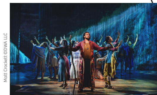
Matt Crockett ©DWA LLC